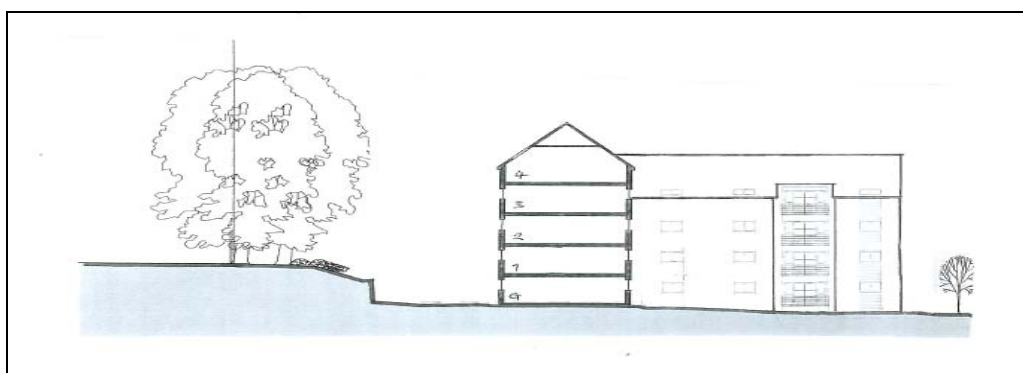
5. Cross section showing relative height of trees to flats as detailed on image number 3 above.

The above plans show the proposed relocation of the west flats to the rear of the site.