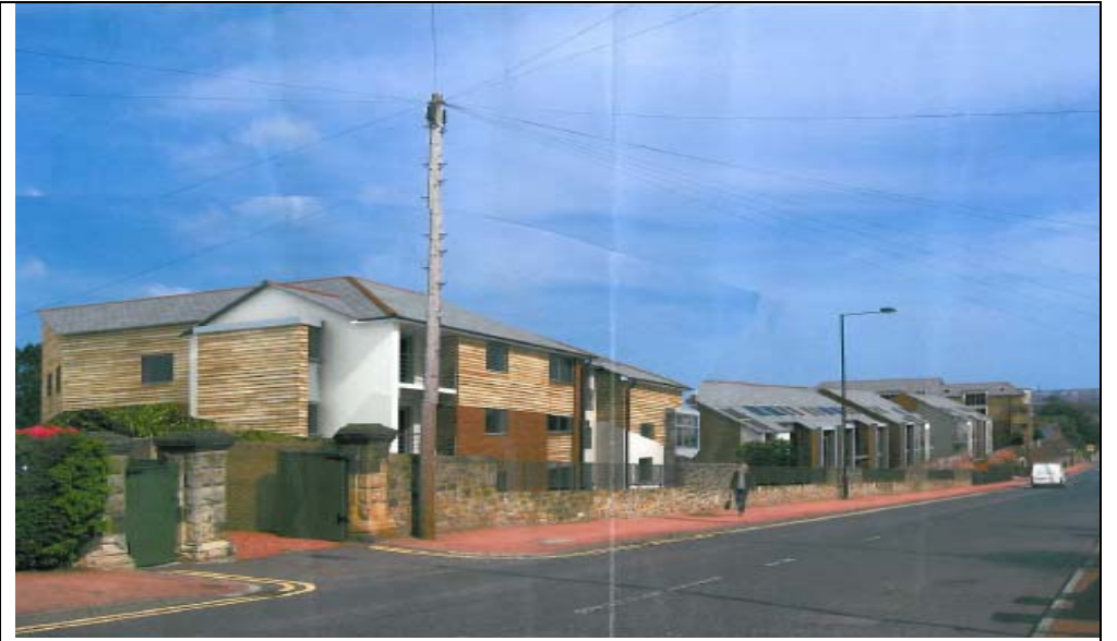
2. Newly revised view from Hexham Road

The above images show the amended artist's impression following the removal of one storey from the east flats.