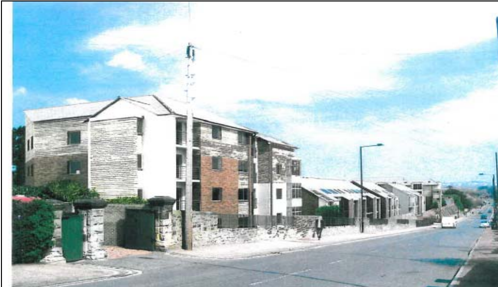
1. View from Hexham Road - as available March 2008

Since our last update and residents meeting on 17 April your Action Group have met with ESH Group. A number of residents' concerns have been considered by ESH and through positive dialogue we have influenced changes (as shown below) to the proposed planning application. However, there are still outstanding issues to be considered such as the style of the development, landscaping of the buttresses and the increased traffic.